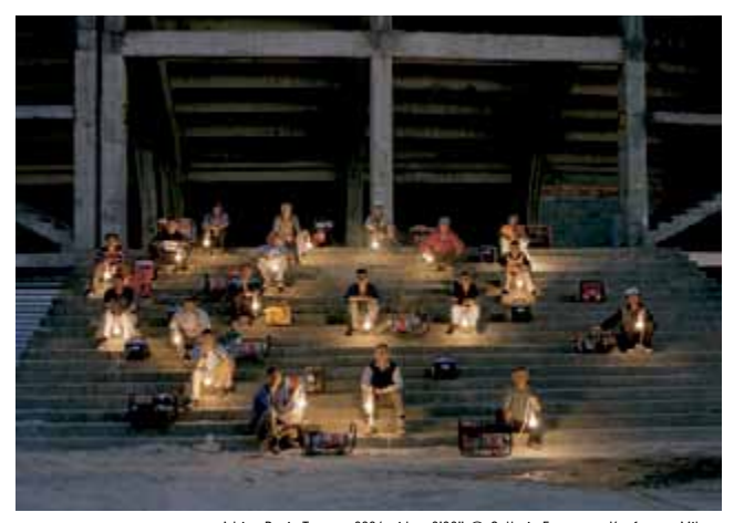
Adrian Paci: Turn on, 2004, video, 3'33"

The twenty-one video art creations appearing in the exhibition document, analyse and contextualise this region and the period burdened by its weight of conflicts. In the place of final answers these works full of string social criticism pry into issues that the countries of the region have avoided in public dialogue and swept under the carpet.