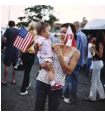
Allan Sekula: Mother and child, "Taste of Polonia" festival. Chicago, September 2007 Chromogenic print, 122 x 122 cm

The world-famous American artist, Allan Sekula (Erie, Pennsylvania, 1951) became known for his documentary photographic and video art. Since the start of his career at the beginning of the seventies he has been interested in undermining the traditional methods of visualisation and artistic representation. Sekula is also a permanent critic of the standard myths of capitalism; he focuses on the person exposed to global capital.