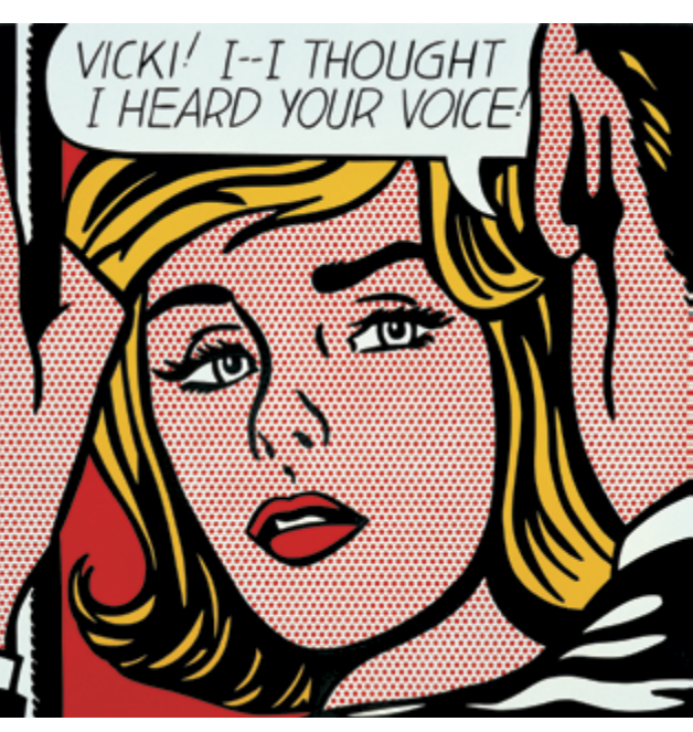
Roy Lichtenstein: Vicki 1964 enamel on steel 106.5 x 106.5 cm long-term loan from the Peter und Irene Ludwig Stiftung, Aachen