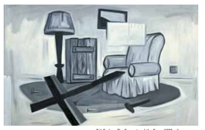
Pál Gerber: The Carpentry of the Cross , 1990, oil on canvas, 132 x 191,5 cm, Collection of Ludwig Museum – Museum of Contemporary Art

From the aspect of genre the material is diverse: the exhibition primarily includes paintings, prints and drawings, but a new installation is also to be constructed. Gerber works with a few excellently positioned