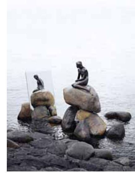
Michael Elmgreen & Ingar Dragset: When a country falls in love with itself, 2008 Lousiana Museum of Modern Art

It asks the question what do we think today about the national identity, tolerance, responsible social and political thinking and what role may contemporary art have in this. Numerous issues are raised starting from personal rights, the division of power and the social construction of identity, including the problems involved with the economy and climate change and the identification of the borderline between the public and the private sphere. It wishes to reflect on the question of nationalism, on the relationship between history and memory, and on how these two phenomena affect each other, and on the extent our concepts relate to these constructs.