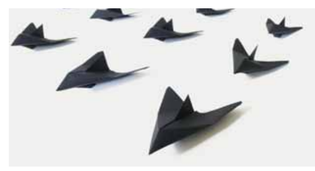
Sašo Sedlaček: Origami Space Race, 2009, installation © Sašo Sedlaček

The exhibited videos, drawings and installations evoke the era and culture of the Cold War: scientific theories, visions and stories about the future. The artists shot their films at ex-secret facilities and which now