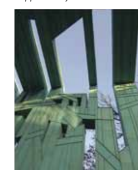
ános Megyik: Gate, University of Debrecen, 2005

The exhibition is realised in the scope of the oeuvre exhibition series supported by the National Cultural Fund.